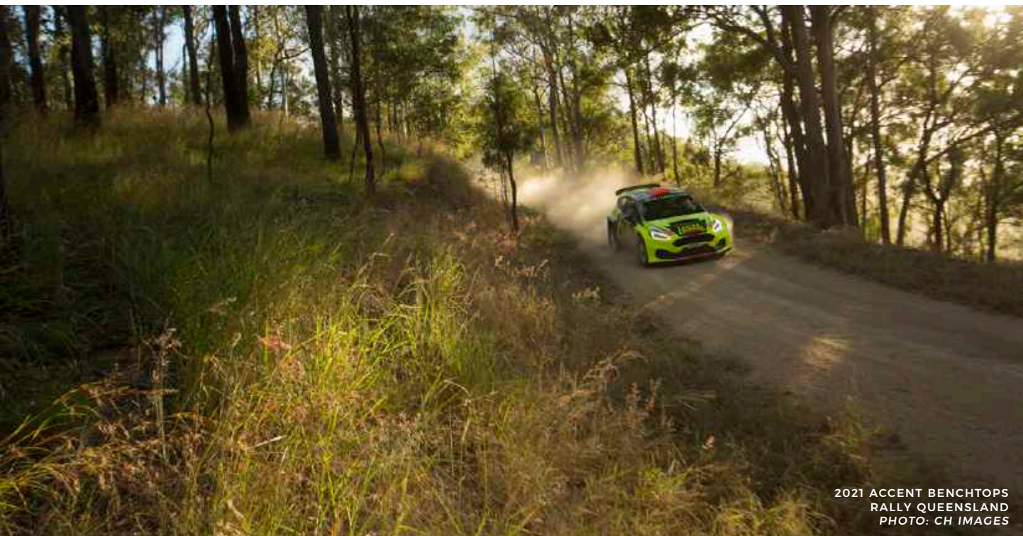
2021 ACCENT BENCHTOPS RALLY QUEENSLAND