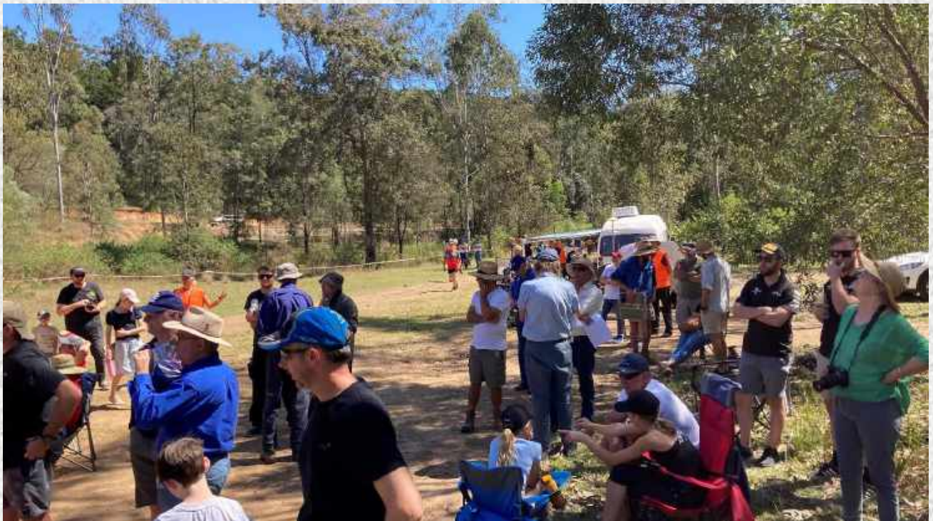
Heaps of space for spectators and less than one km from HQ and Service. Again – Brilliant.