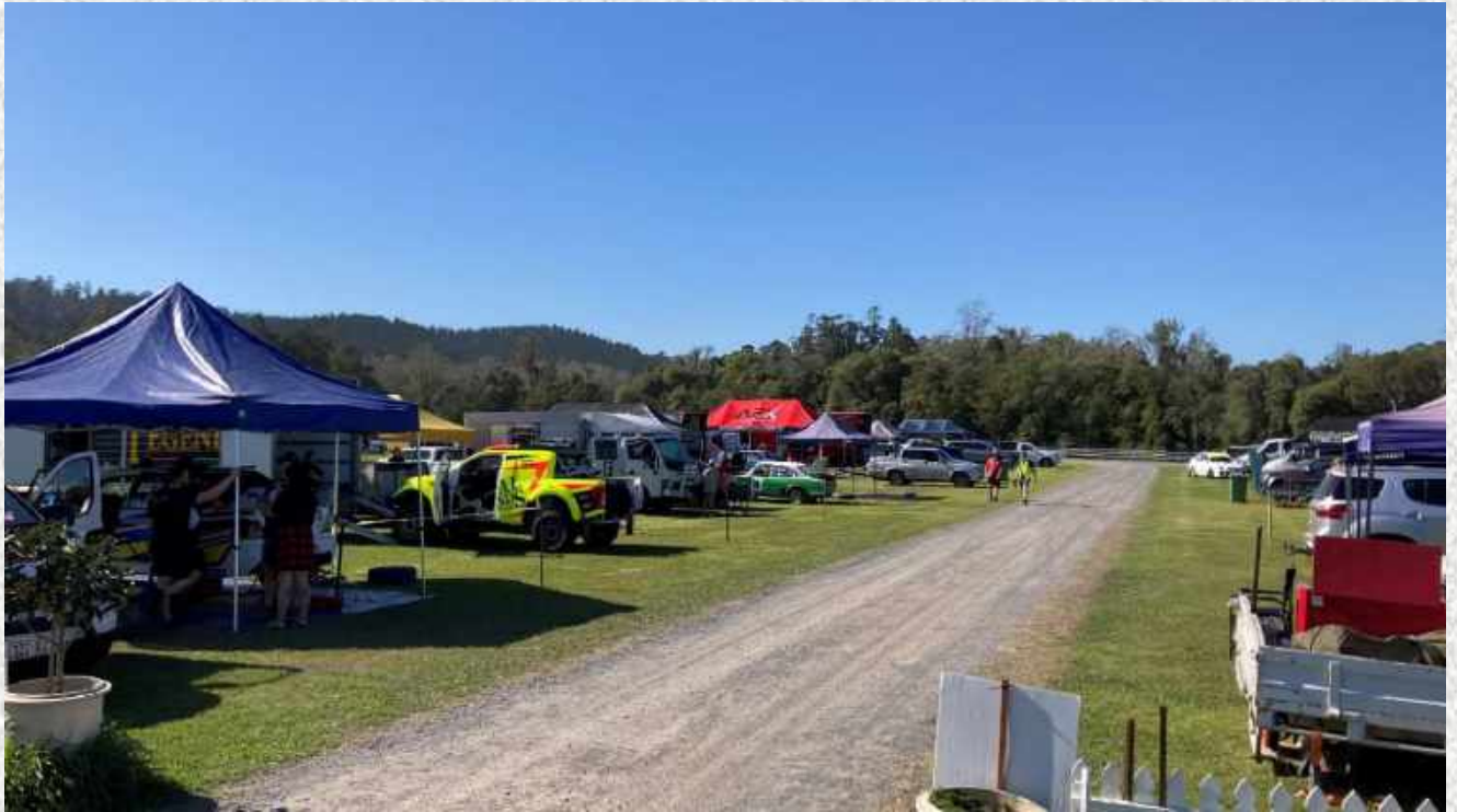
Plenty of flat ground for servicing and roads around the service park.