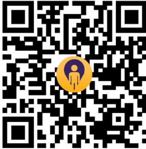
Attendance Record QR Scan