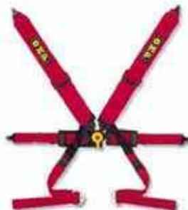
FIA approved harnesses