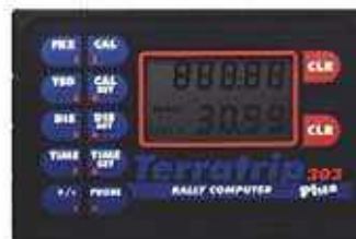
TerraTrip Rally Computers