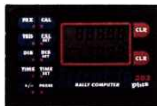
TerraTrip Rally Computers