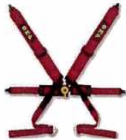
FIA approved harnesses