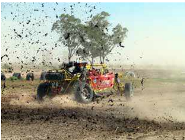
Svenson throws up the dirt

The event proper consisted of three sections each of three laps of the fifteen kilometre course. Due to the dusty conditions the field was run in two groups.