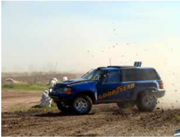
Hunter on the pace

Round two of the 2008 Queensland Off Road Drivers Series and Round two of the Off Road Long Course Championship was run at Goondiwindi over the weekend of 15 th & 16 th of March.