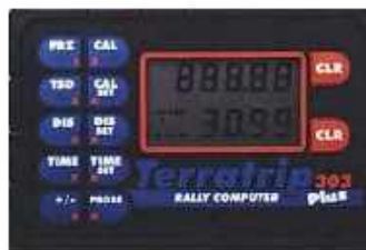
TerraTrip Rally Computers