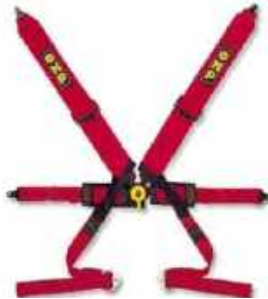
FIA approved harnesses